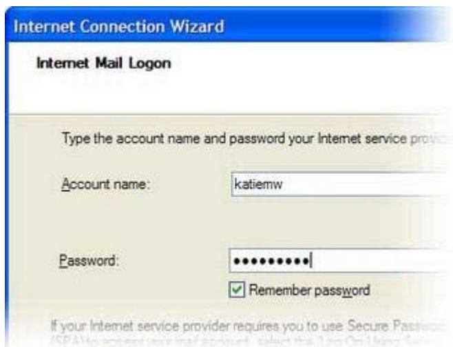
Internet Connection Wizard's Internet Mail Logon

Note: If you're concerned about break-ins to your e-mail, click to clear the check in the Remember Password box. You'll then be prompted for the password each time you send or retrieve mail.